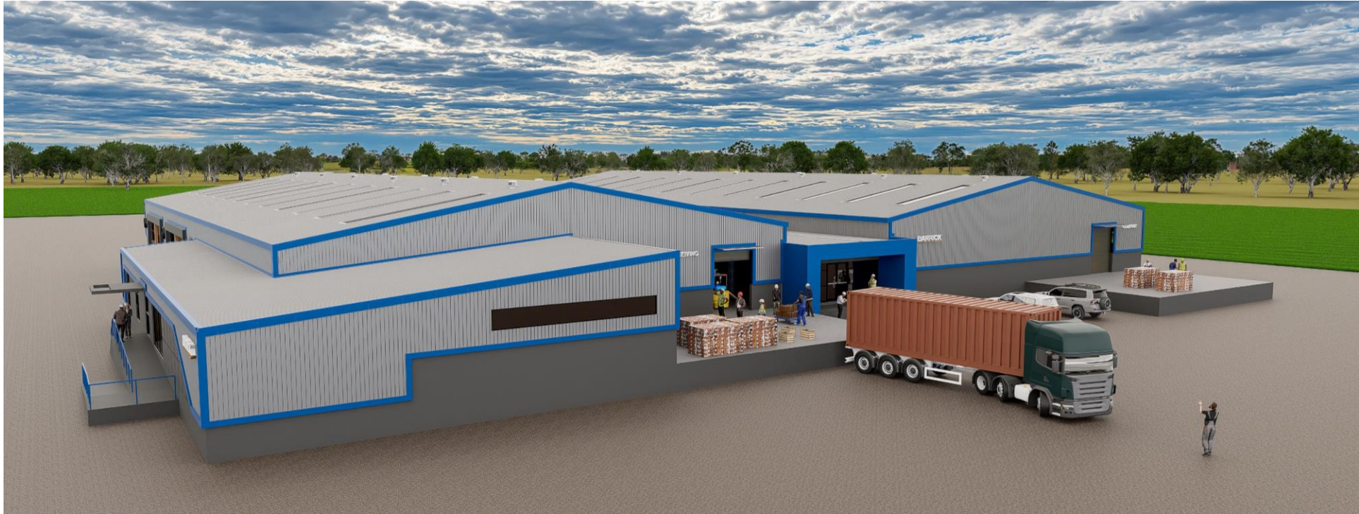
Artistic Impressions 7